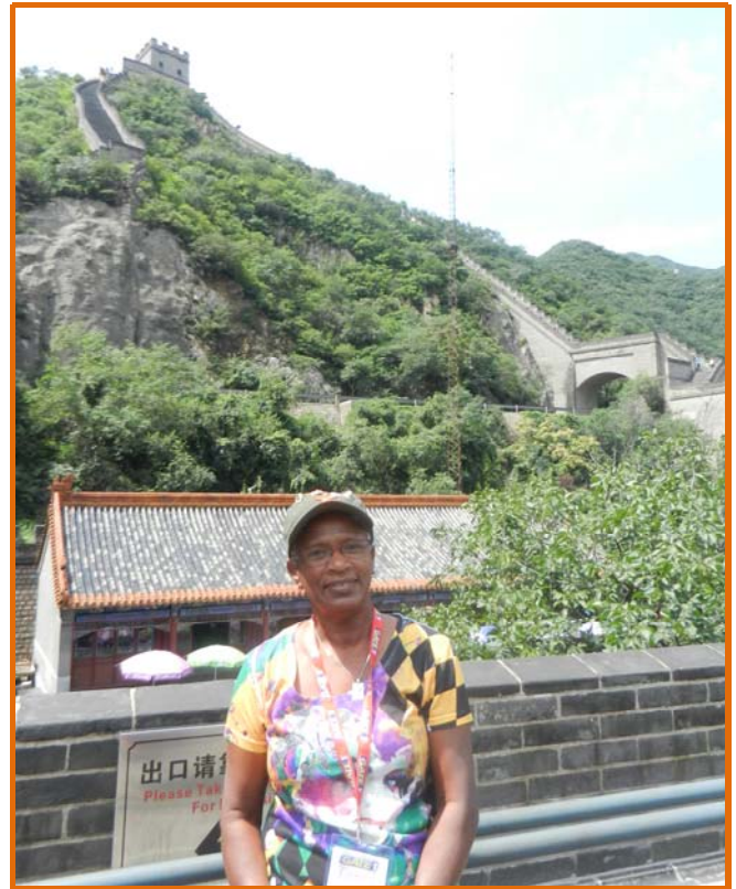
Pearl at the Great Wall of China

On the fifth day we visited three museums which house the tomb of China's 1 st Emperor, and more than 8,000 life-size sculptured terracotta soldiers and horses that were discovered by a farmer in 1974.