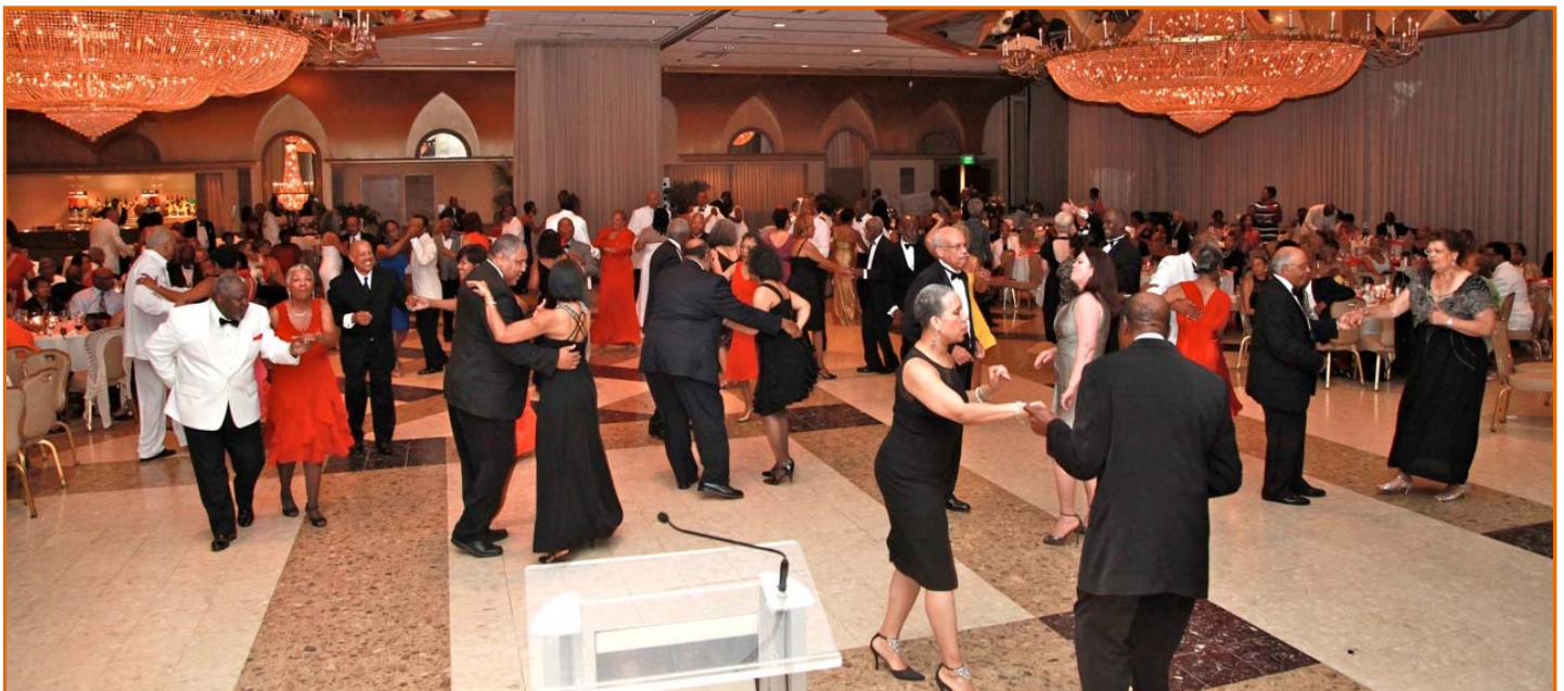
They could have danced all night at Banneker Ballroom's June 2012 Gala.

Evening wear has played a stunning role in enhancing the wearer as well as the special occasion in a very supportive way. Banneker's star-studded affair has rivaled any red carpet affair each year.