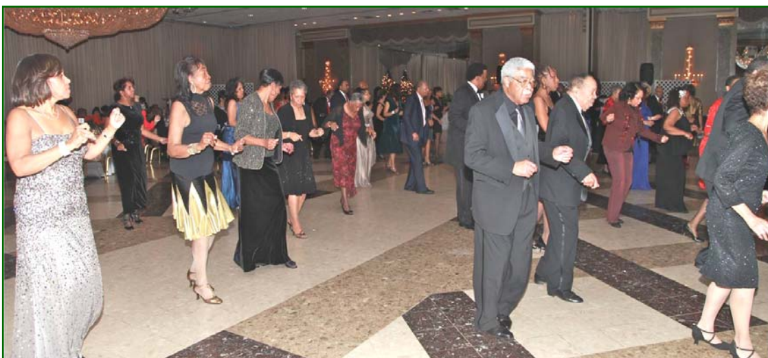
Everybody loves a line dance.